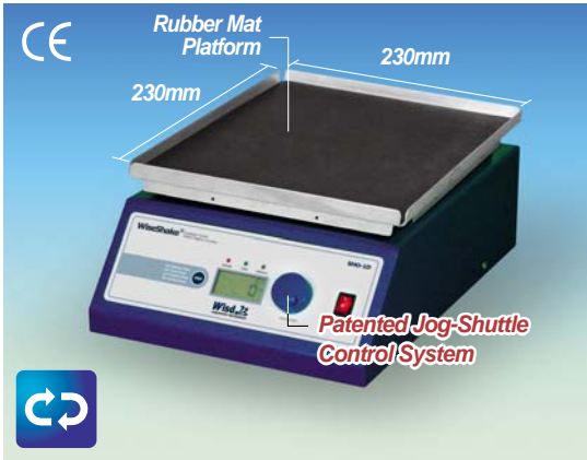
Digital Orbital Shaker (SHO-1D) with Rubber Mat Platform (SP110)